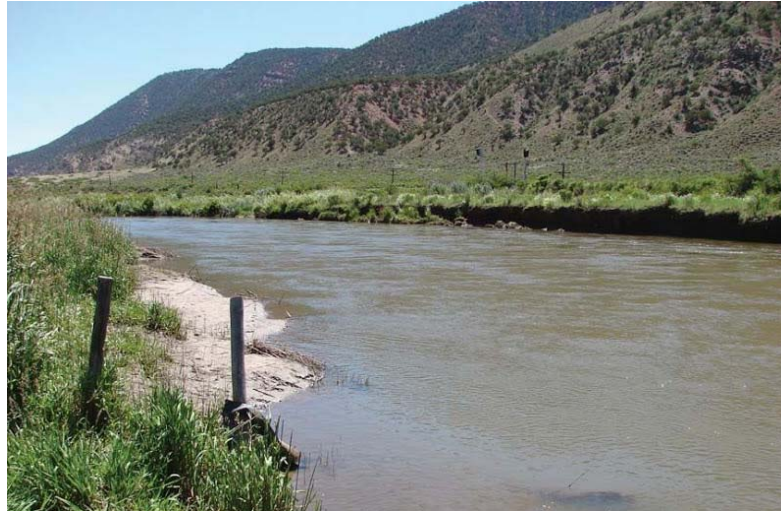
Public fishing and hunting access at Duck Pond Conservation Area

experience the great outdoors and enjoy public access to your Eagle River.