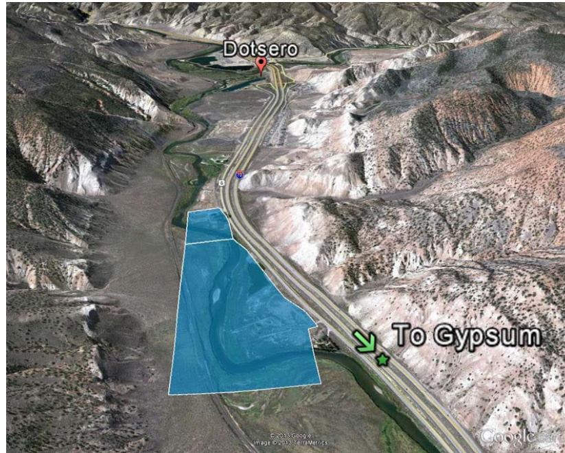
A duck's eye view of the Duck Pond Conservation Area