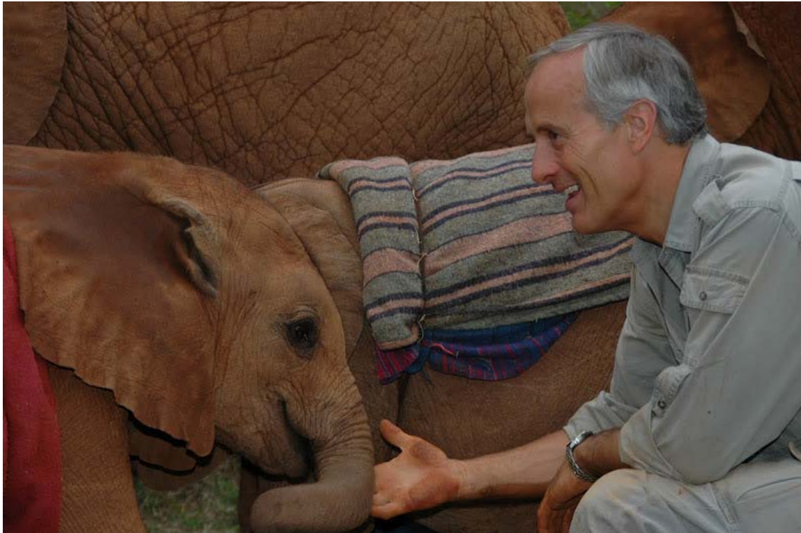
Jungle Jack with a Baby Elephant